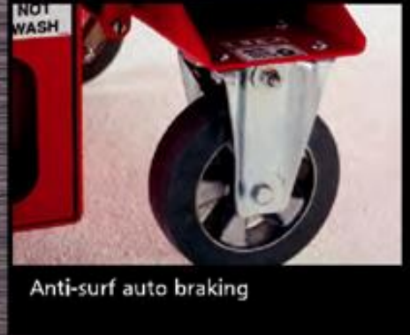
Anti-surf auto braking