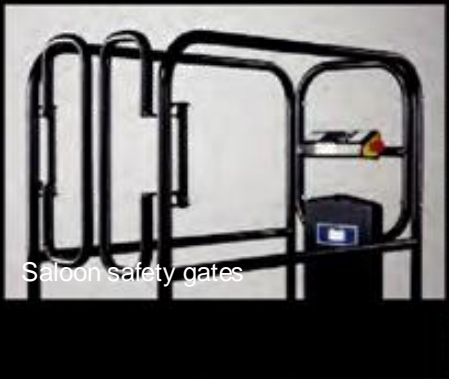
Saloon safety gates