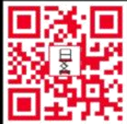
SCAN TO SEE MORE