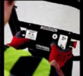
HANDS PROTECTED OPERATION