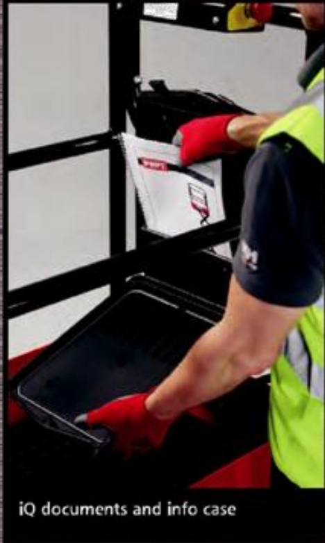
iQ documents and info case