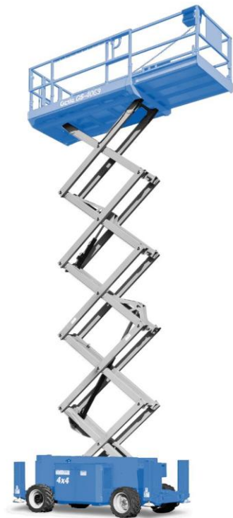
07/15 Part No. B127284UK