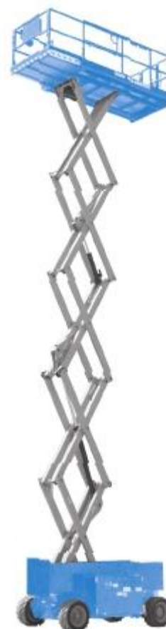
07/15 Part No. B127292UK