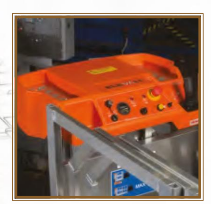
Convenient storage tray

Light and easy to handle, the 65 EM, with its basket, which can be extended over 1 m, is the ideal solution for maintenance work and industrial assembly.